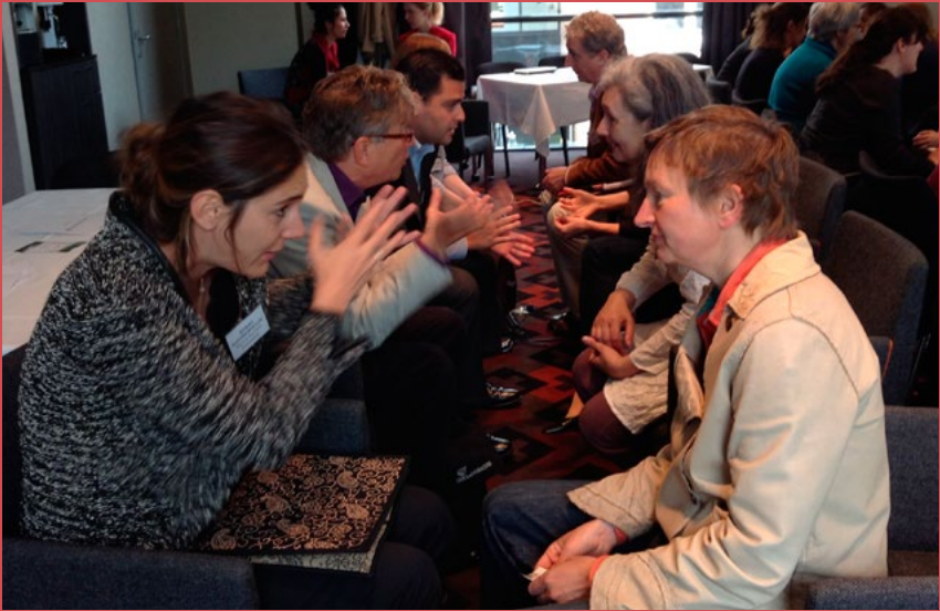
Ariadne members speed-networking at the 2013 Policy Briefing

ARIADNE provides excellent and time-saving opportunities to meet colleagues from small and large partner organisations, to exchange in-depth information about my specific field of work, and to share knowledge with others.