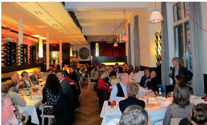
Ariadne members at the 2013 Policy Briefing and Networking Dinner